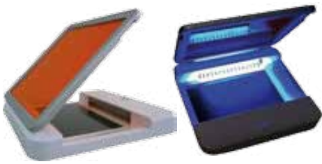
Fig. 1: The FastGene® LED Illuminator (Cat. No. FG-05)