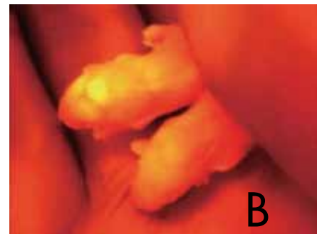
Fig. 2: Detection of fluorescent proteins (A) In bacteria: The blue/green LED technology is able to excite the red fluorescent proteins (RFP or mCherry). This was used to select the positively expressing colonies. (B) In mice: The expression of GFP transgenic mice can be verified using the FastGene® Blue/Green LED Flashlight. The top mouse is expressing GFP in its neural tissue, the lower mouse is the negative control and does not show any fluorescence.