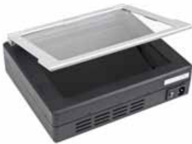
Fig. 3: The FastGene® UV Transilluminator (Cat. No. FG-300)

The achievable sensitivity of the detection of DNA, stained with Ethidium Bromide, is strongly dependent on the quality of the UV lamps and of the filter material. High quality UV tables show almost no visible light. The quality of the UV light source and of the filter can easily be tested: UV light is invisible to the human eye. If the position of the UV lamps are easily detectable, then the quality of light bulbs and the filter are inferior. The FastGene® UV Transilluminator passes this test without a problem. Furthermore, the FastGene® UV Transilluminator includes a specifically manufactured filter system and shows a very effective protection against harmful UV radiation.