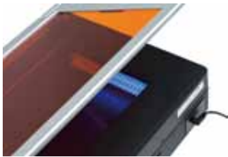
Fig. 2: The FastGene® Blue LED Transilluminator (Cat. No. FG-06)

The FastGene® LED Illuminator and the FastGene® LED Transilluminators are using LED's. Light from the blue LED source inside the instrument produces light with a narrow emission peak centered at approximately 470 nm, effective for the visualization of nucleic acid stains such as Midori Green and SYBR® dyes. Whereas UV light shows the highest sensitivity with dyes like Ethidium Bromide, the longer wavelength lead to perfect results with the new dyes mentioned above.